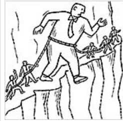
Op-Ed: Regulate Me, Please