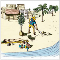
Getaways That Are 'Guilt Free'